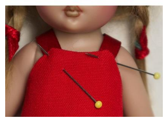
TOP TIP: Dab a tiny bit of clear nail polish or white glue on the edges of the trim to prevent fraying.

Stitch a couple of buttons or beads to hold the straps into place. You can also leave the straps long and position them on the outside like this: