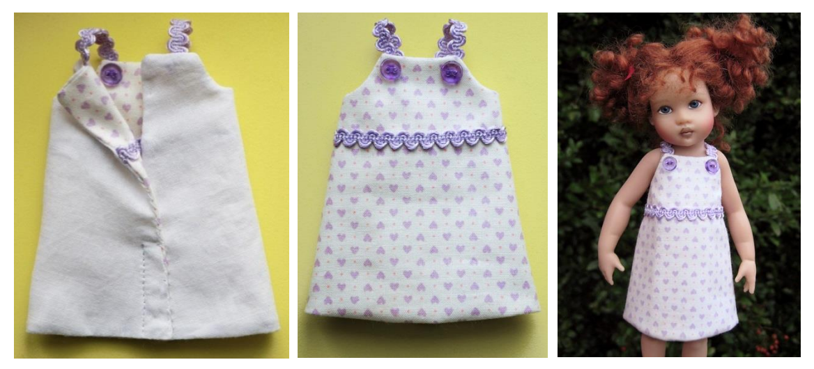
You could make several of these dresses, making each one totally unique. They are perfect for dressing all of your dolls up for a theme or for a holiday occasion.

The left bottom photo shows the back inside-out view of the dress as it should look before you add the snap fasteners. I used a combination of machine and hand-stitching to close the dress. There is not really a right or wrong way to do this. You could opt to sew snaps all the way down the back instead of closing the bottom with stitching. The purple buttons are a bit big in scale, but Riley is a little doll.